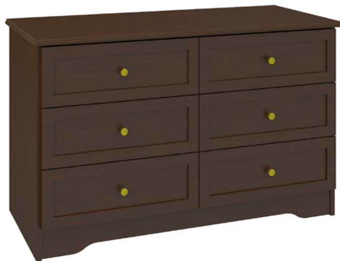
Model: MIDR60 48.5W 19D 30H

Time-honored crafting and practical concerns blend to produce refined, functional furniture. OG edging and gently radiused corners add understated touches of distinction to these water- and scuff-resistant, fire-retardant products. Choose from dozens of hardware styles, including ADA-compliant. The product is required to be wall mounted for safety. Using the kit provided, please follow provided instructions exactly.